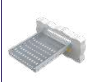
Vantrunk Cable Tray Tray End Plate used to support tray at wall aperture